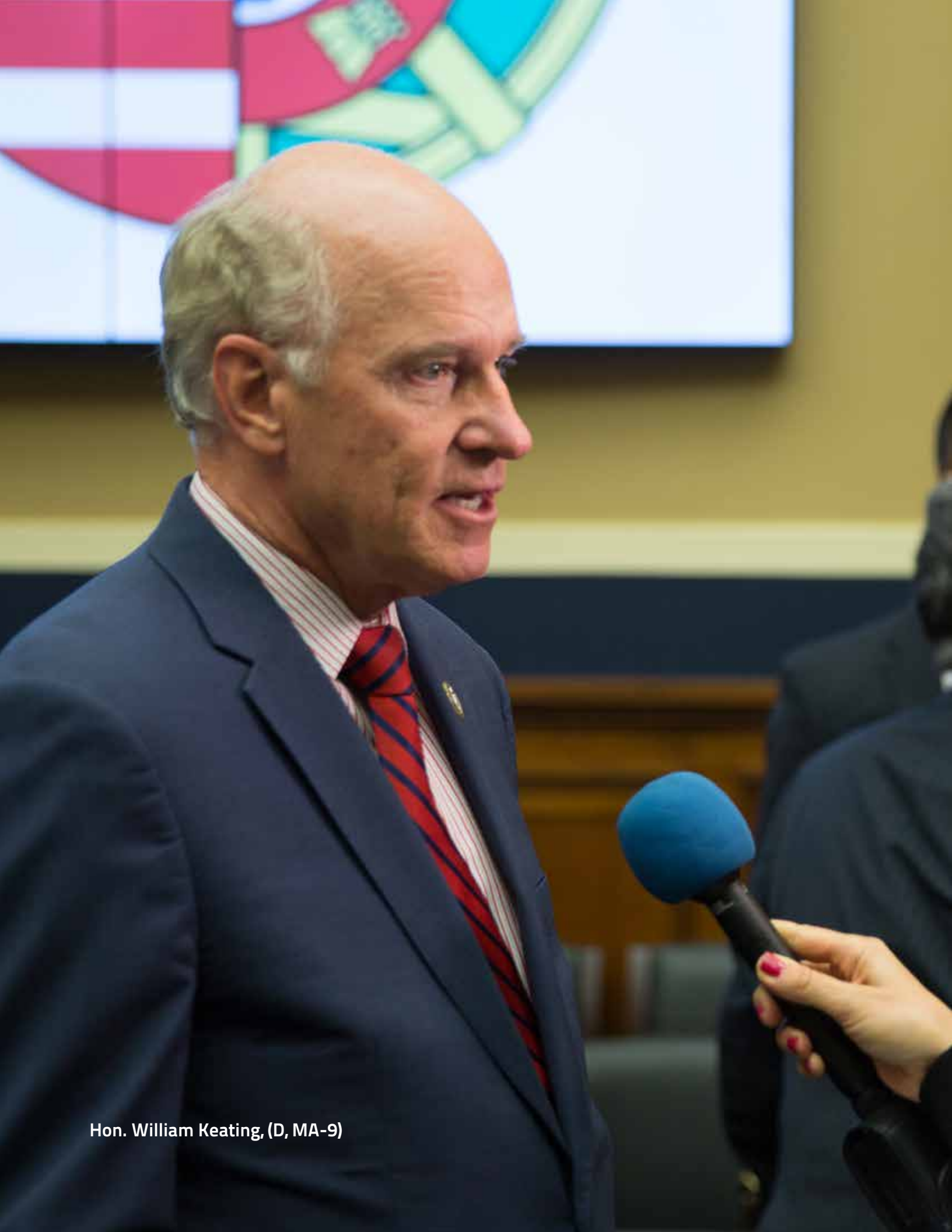
Hon. William Keating, (D, MA-9)