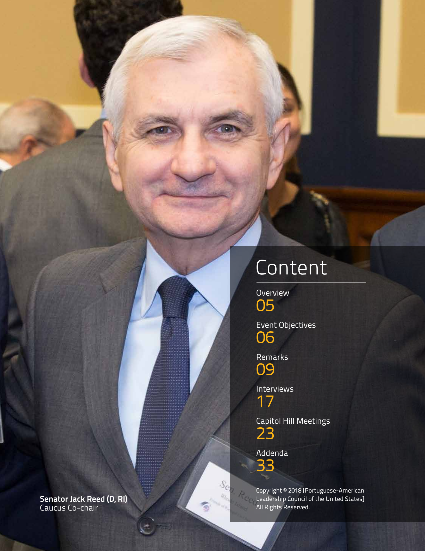
Senator Jack Reed (D, RI) Caucus Co-chair