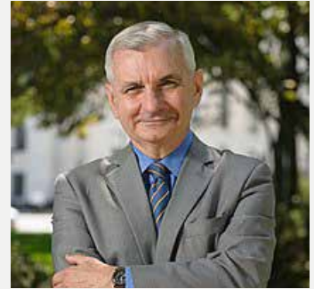
Hon. Jack Reed U.S. Senate

I will just simply reflect on the fact that so much of our country has been built by strong and proud Portuguese-Americans. We owe a great debt to them. They like other people who have come here, they are Americans but they are Americans with a particular spirit of industry and decency and we celebrate that."