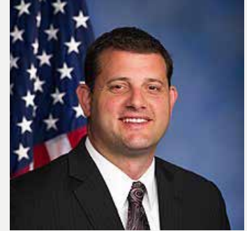
Hon. David Valadão U.S. House of Representatives

My parents were Portuguese immigrants themselves . I grew up in a household in a Portuguese community. Still to this day they try to be as active as they possibly can in the local community. It's important that we continue to work together and continue to build on the next generation, to understand what the heritage is and how great it has been for a lot of us."