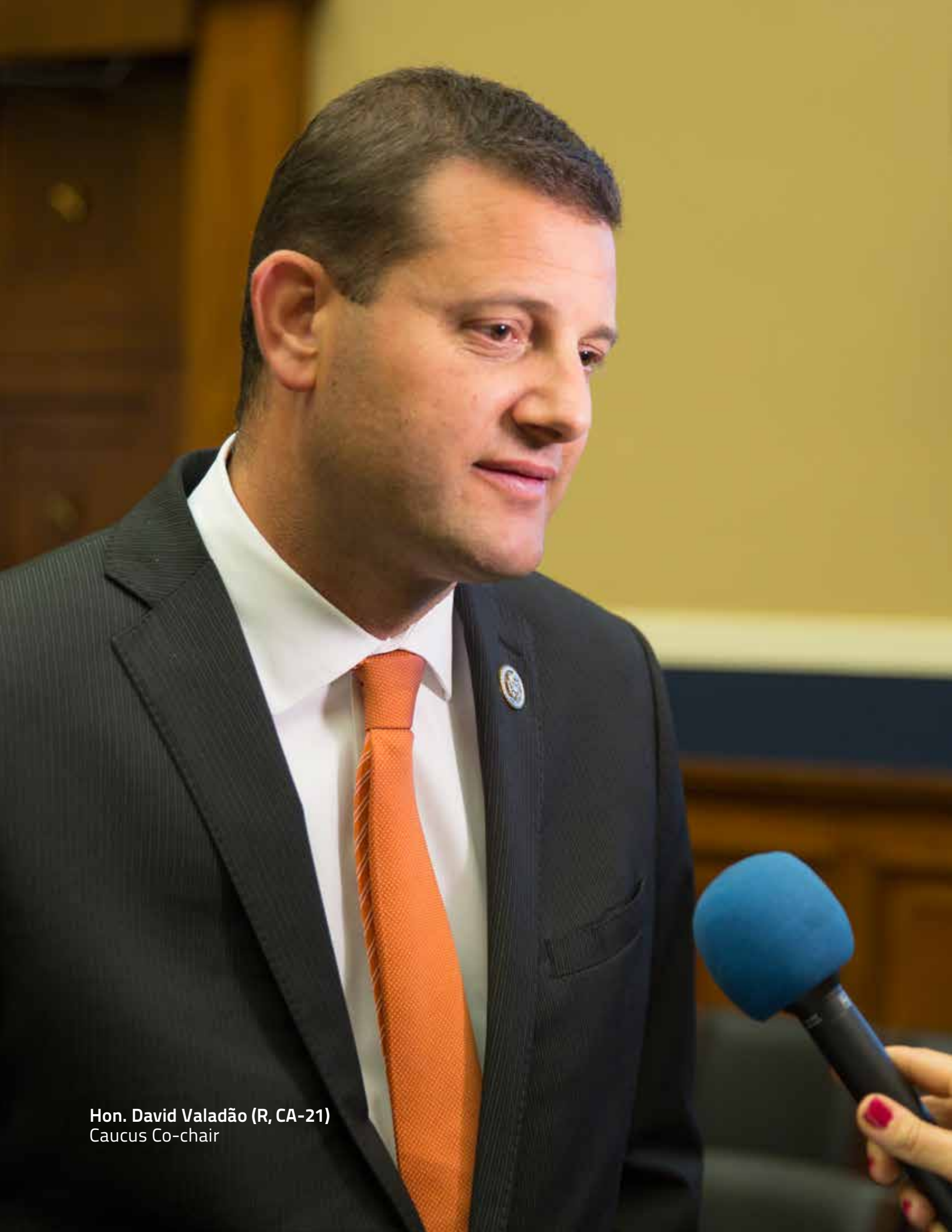
Hon. David Valadão (R, CA-21) Caucus Co-chair