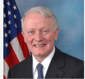
Hon. Leonard Lance U.S. House of Representatives

You are welcome on Capitol Hill at any time and certainly, we believe the strength of this nation is based on its strong immigrant heritage and may that continue. We want a strong and vibrant United States based upon those who have chosen to live here either personally, or through ancestors, and we hope in your visits in Capitol Hill that you will be welcomed cordially by all of us."