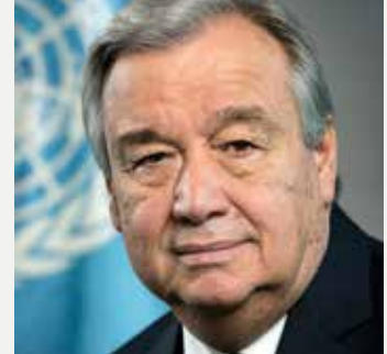
António Guterres Secretary-General of the United Nations

Please accept my best wishes for a memorable gathering.